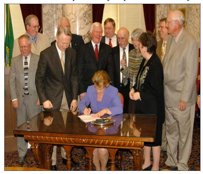
(Continued on page 21)

On April 15, 2007, in the Legislative Building's State Reception Room, Governor Christine Gregoire signed legislation financing the Washington State Heritage Center. The $112 million dollar, state-of-the-art facility, proposed by Washington Secretary of State Sam Reed, will house and display many of the state's unique historical records, publications and artifacts in a secure, environmentally controlled environment. The Heritage Center will combine the State Archives, the State Library, and State Capital Museum exhibits in one facility, providing citizens and visitors with centralized access to state and local history. "I firmly believe that we have a responsibility to protect our history