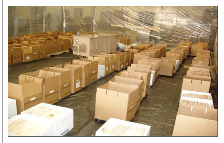
Dehumidification chamber with fans and dehumidifiers to dry out the boxes and folders.

The next day, April 19, a secure, fenced area was constructed in Building 12 and staff from Belfor enclosed it with plastic sheeting to create a dehumidification chamber. Dehumidifiers and a large fan were placed inside to start the drying out process.