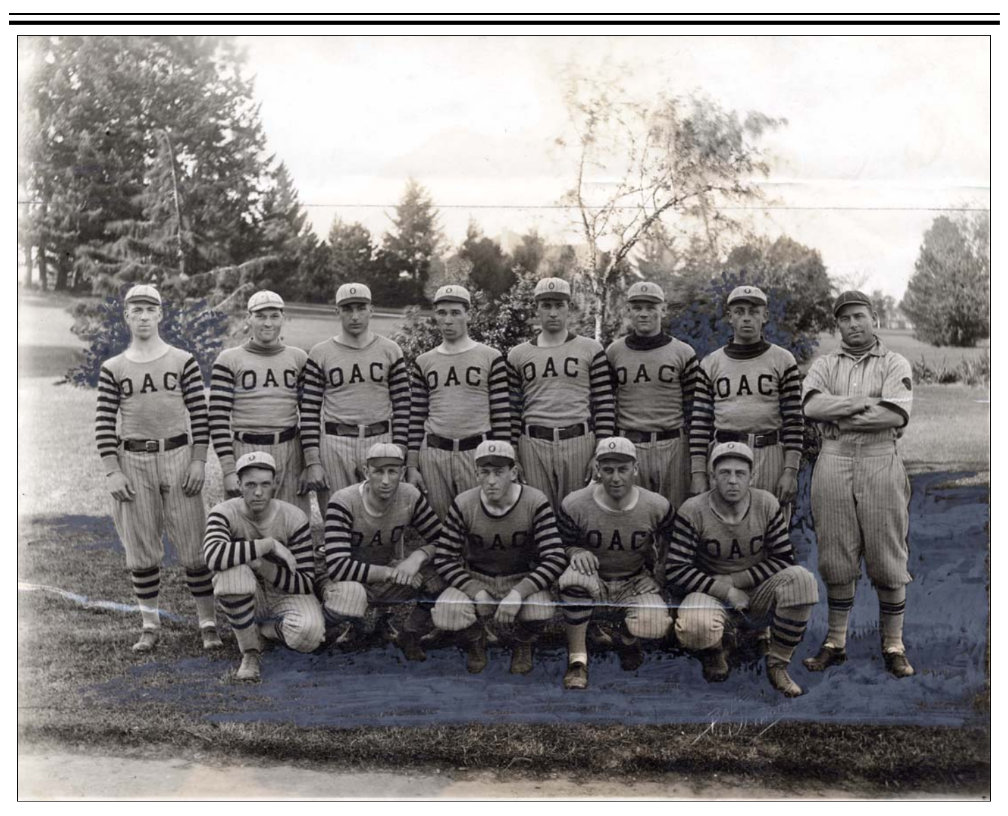
1914 Oregon Agricultural College baseball team

Oregon State Baseball: 100 Years to a National Championship, 1907-2006