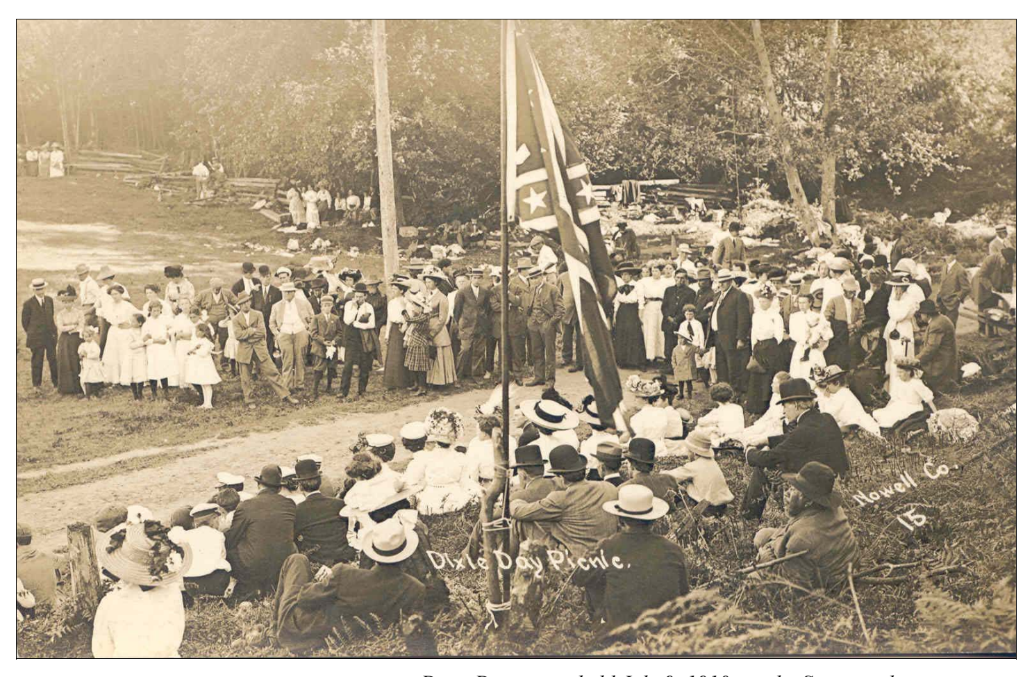
{\it Dixie Day picnic held July 9, 1910, on the Suquamish reservation.}