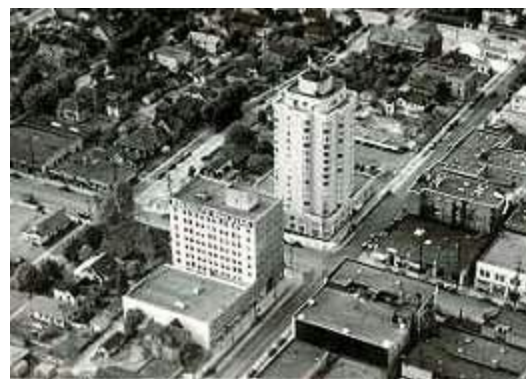
Postcard, Meany Hotel, 1950s Washington State History Link