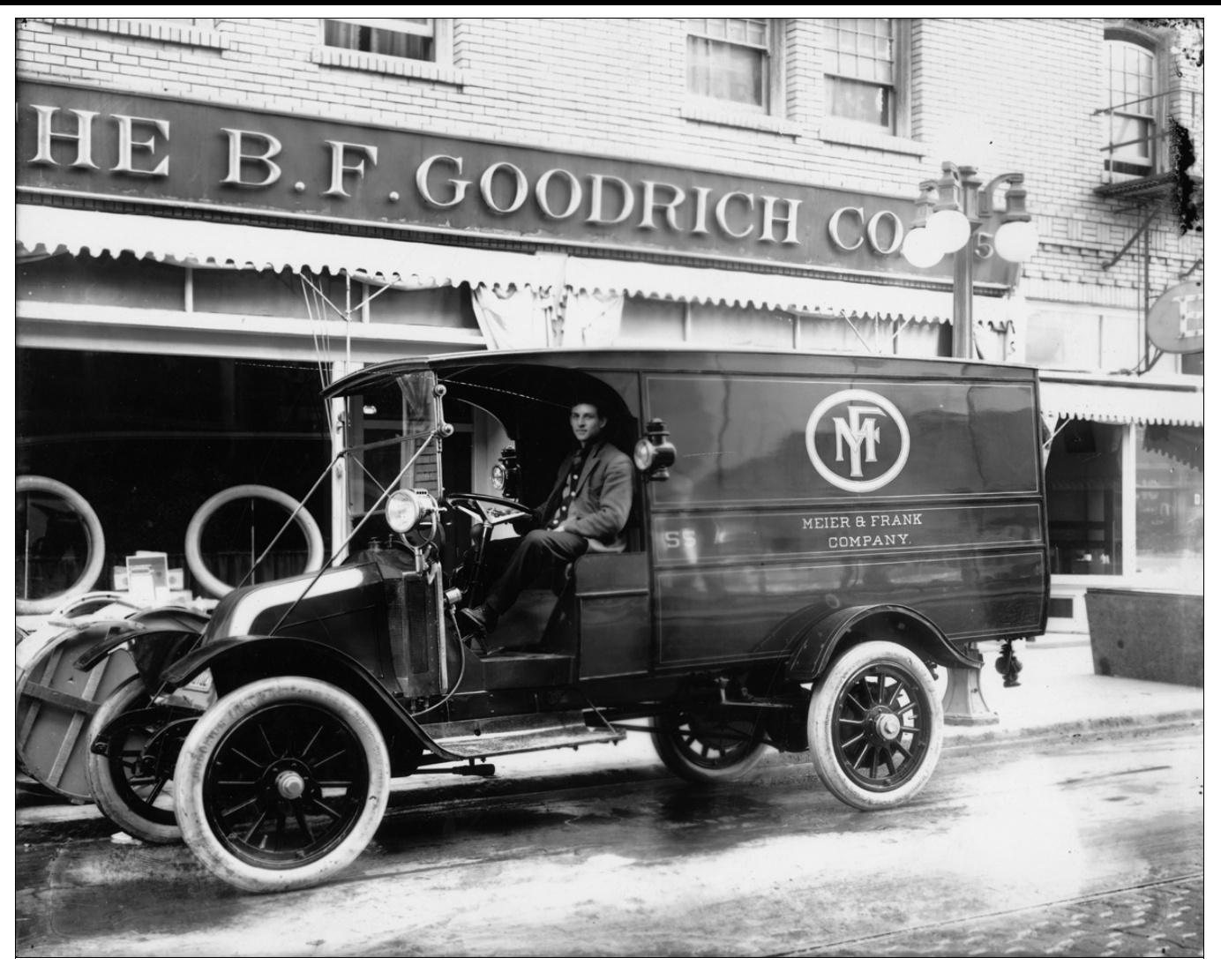
Meier and Frank Co. delivery truck, Portland, circa 1905, from the Meier and Frank collection, Mss 2866, Oregon Historical Society Research Library

The Meier & Frank Collection (Profile on Page 17)